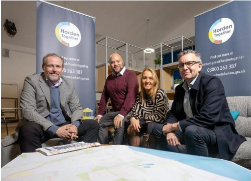
Horden Minewater Project