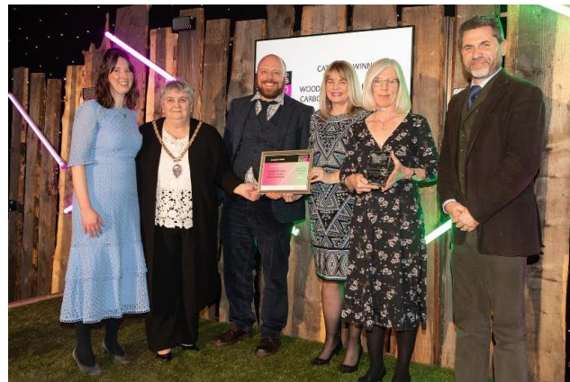
County Durham 33 rd Environment Awards