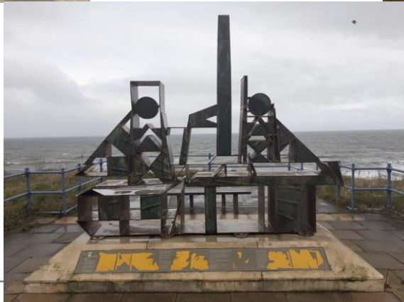
Non-designated Heritage Assets Project