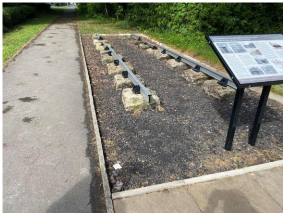
Stockton and Darlington Railway heritage Action Zone