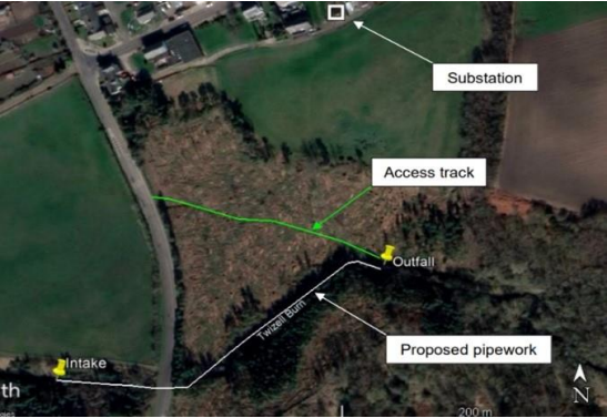
Twizel Burn hydro-power feasibility study