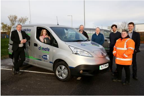
Try Before You Buy EV vans